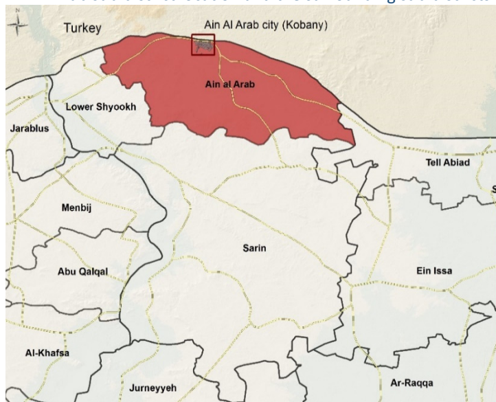
Ain Al Arab sub-district location and the surrounding sub-districts

of them settled down in Turkish camps and the others returned to some Syrian areas with Kurdish population like Afrin, Ras Al Ain, Darbasiyah, and other areas.