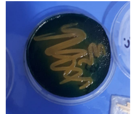
Contact positive Stool culture